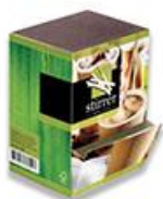
11406 & 13786