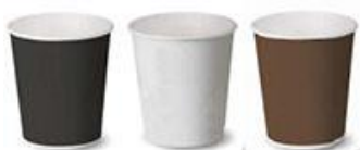
105, 107, 108,109