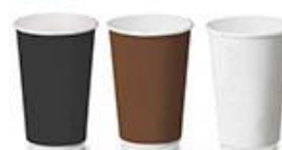
105D, 108D, 109D