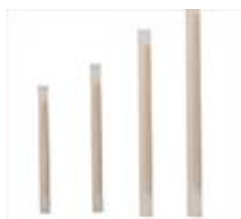
FSC90I - FSC110I - FSC140I - FSC180I