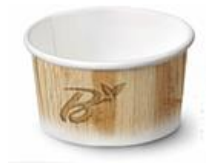
Design code: BIO-60