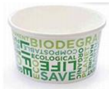
Design code: BIO-64