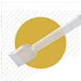
XC08BIO/TR & XC10BIO/TR